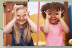
Competition Pool Resort Style Pool New Playground Coming Soon