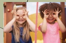
New Playground Coming Soon